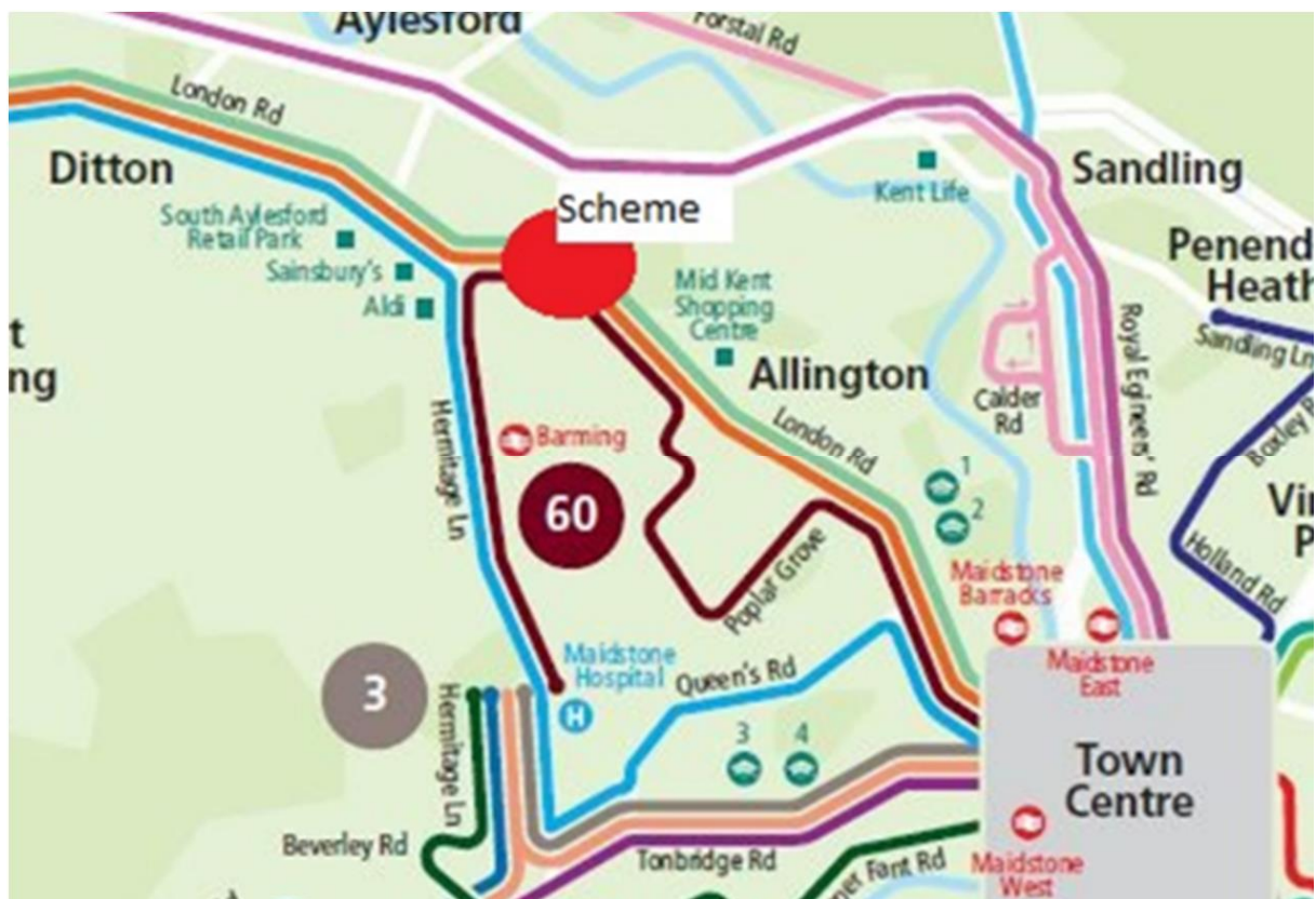
Figure 1.2: Bus routes